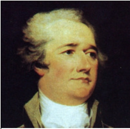
Federalist leader Alexander Hamilton